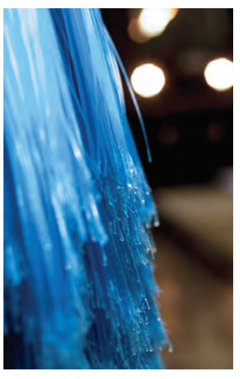
Polyethylene Brush Filaments

We care about protecting the finish on your vehicles. Made with rigid quality standards, Westmatic synthetic brushes feature high-quality raw materials and are affixed to a patented plastic backing. This provides a sturdy structure and ensures the durability of the brushes. An exclusive feathering process makes the end of the bristles soft and delicate. In keeping with Westmatic's clean and green emphasis, the brush units are 100% recyclable.